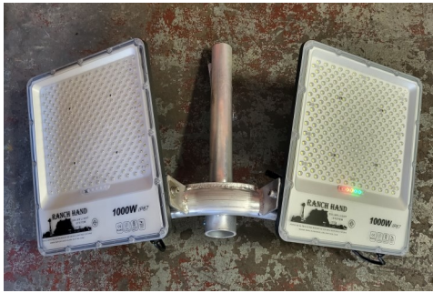
PRO Series Light Mount Bracket with Lights Pre-Installed