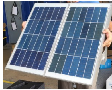
Solar Panel Assembly FRAGILE*